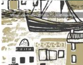
image shows area 70cm x 70cm at max size