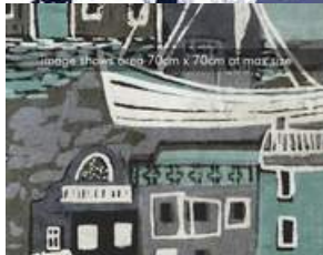
image shows area 70cm x 70cm at max size