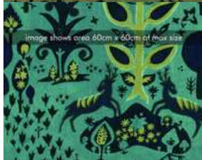
image shows area 60cm x 60cm at max size