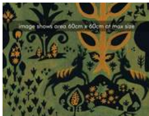
image shows area 60cm x 60cm at max size