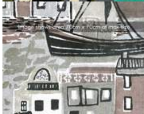
image shows area 70cm x 70cm at max size