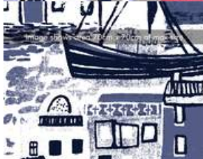
image shows area 70cm x 70cm at max size