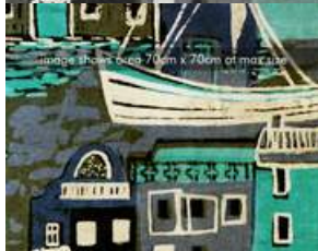
image shows area 70cm x 70cm at max size