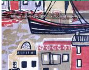
image shows area 70cm x 70cm at max size

image shows area 60cm x 60cm at max size