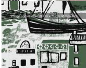
image shows area 70cm x 70cm at max size