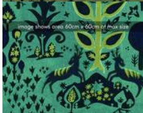
image shows area 60cm x 60cm at max size