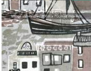
image shows area 70cm x 70cm at max size