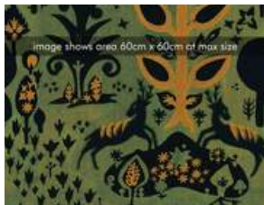
image shows area 60cm x 60cm at max size