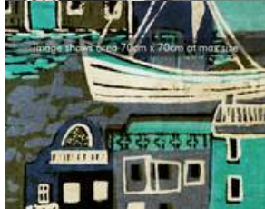
image shows area 70cm x 70cm at max size