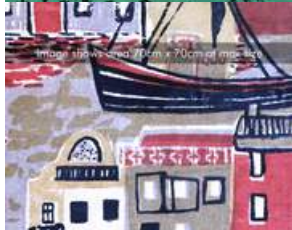
image shows area 70cm x 70cm at max size

image shows area 60cm x 60cm at max size