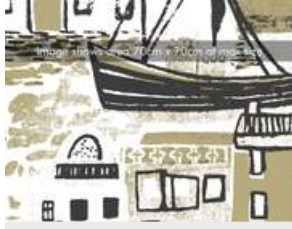
image shows area 70cm x 70cm at max size