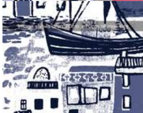
image shows area 70cm x 70cm at max size