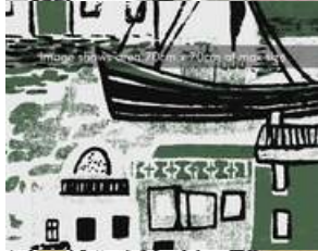
image shows area 70cm x 70cm at max size