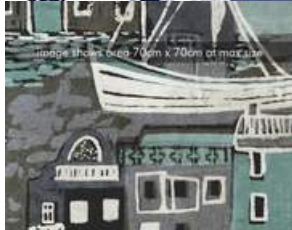
image shows area 70cm x 70cm at max size